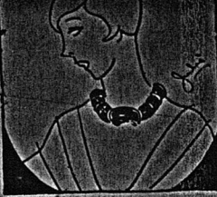
A new choker called the "Venezia" has a large Cabochon sapphire which is worn in front. Made of simulated gems in different tints and colors. Ugers-ova-mainsalte and peacock.

...and wife... ...City who... ...they motor... ...and... ...truck driver... ...hospital Saturday after... ...noon... ...Funeral services... ...in Old Union church at 2:00 o'clock... ...Monday afternoon with burial in the... ...church cemetery... ...He is survived... ...by the widow, three children, the... ...mother and one brother.